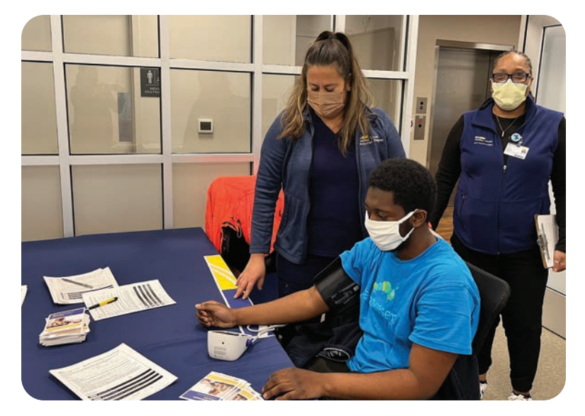
▲ Nurses in the Emergency department at MedStar Union Memorial Hospital and Community Health staff visited Hampden Family Center. Clients received blood pressure screenings and education about diabetes and heart disease. The MedStar Health team also helped clients find health care and community resources.

▲ MedStar Health associates supported Spring Back to Health at J Van Story Branch Apartments. The team provided blood pressure screenings, hands-only CPR, pre-diabetes screening, healthcare navigation, chair exercise, 988 crisis hotline information, and an opportunity to "Ask A Doc" with MedStar Health medical residents.