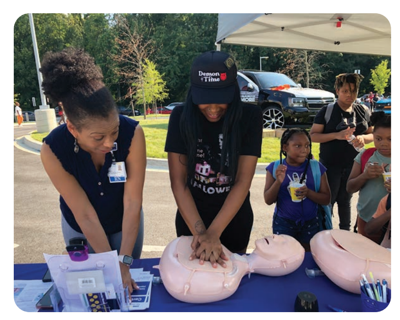
Attendees at Northwood Elementary's back-to-school event had the opportunity to learn CPR at the MedStar Health table.

At MedStar Health, serving our communities is at the heart of what we do. As healthcare leaders in the region, we recognize the importance of our role in advancing health and partnering with others to facilitate community health improvement.